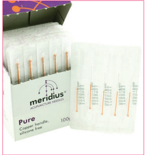
Chinese-style copper handle