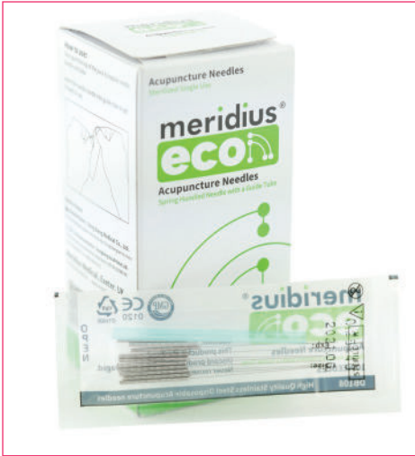
Economic and Eco-friendly