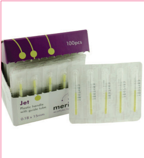
Silicone coated premium needles