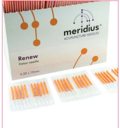
Vibrant plastic colour-coded handles